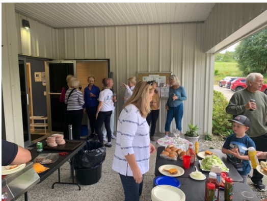
BBQ fun in the sunshine for all the family